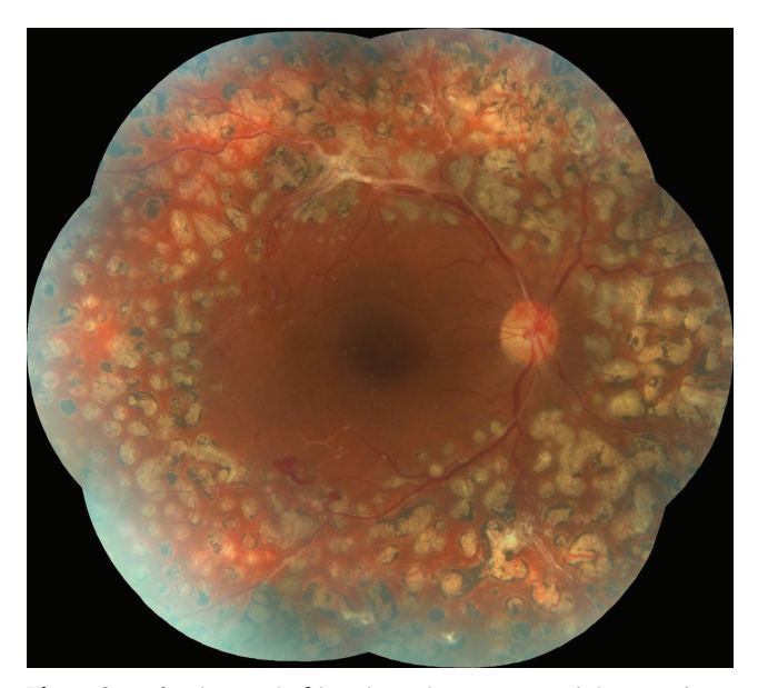
Figure 3. Fundus photograph of the right eye showing panretinal photocoagulation scars along with regressed neovascularization

detachment in the left eye. Anterior chamber injection of 1.25 mg bevacizumab (Altuzan, Roche, Germany) was performed and topical dorzolamide-timolol fixed combination (Oftomix, Bilim İlaç, İstanbul, Türkiye) and brimonidine (Alphagan P, AbbVie, İstanbul, Türkiye) were initiated twice daily. His clinical follow-up was stable for both eyes with no pain in the left eye for 3 years, and no additional bevacizumab injection was needed.