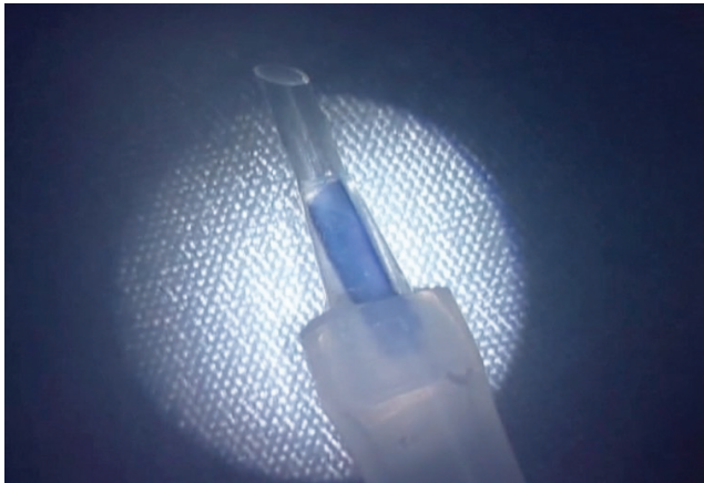
Figure 2. The tip of an IOL injector cartridge was combined with a silicone tubing set to create the custom-made injector

a capsular tension ring (CTR) was used in all of the patients before IOL implantation. No dispersive viscoelastic material was used during the cataract surgery to prevent graft dislocation after DMEK. After implanting the IOL and clearing all the viscoelastic material behind the IOL, additional viscoelastic material was applied into the anterior chamber and peripheral iridectomy was performed with a 23-G vitrectomy probe. Then descemetorhexis was performed under viscoelastic material. After descemetorhexis, the main incision was enlarged to 3 mm and DMEK procedures were followed.