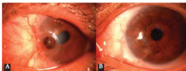
Figure 2. A) Corneal perforation and iris prolapsus is observed. B) The clear corneal graft is visible at postoperative 6 months